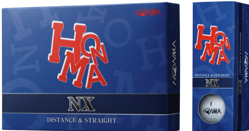
『HONMA NX』 (Color: White)

Please refer to summary details on the next page.