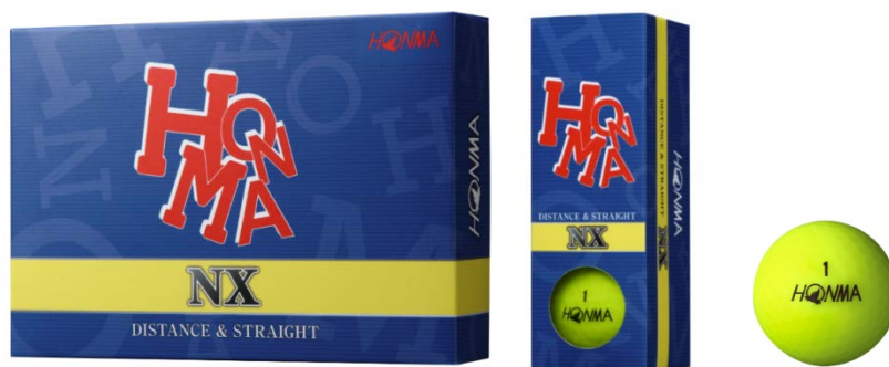
『HONMA NX』 (Color:Yellow)