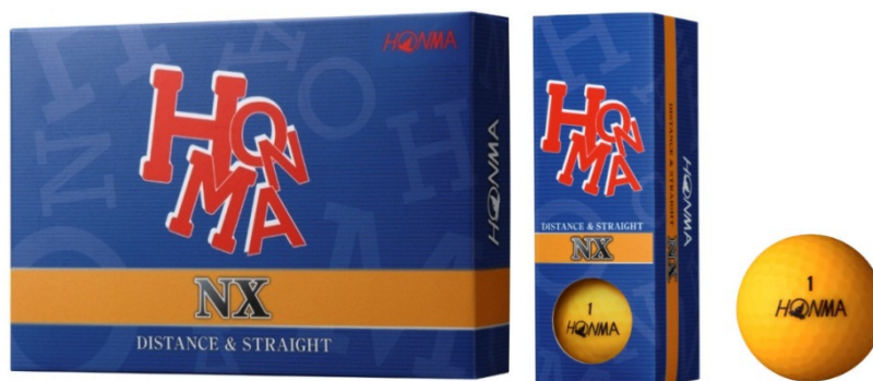
『HONMA NX』 (Color:Orange)