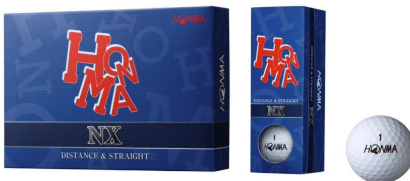
『HONMA NX』 (Color:White)