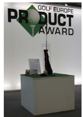
GOLF EUROPE PRODUCT AWARDS 2010