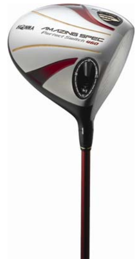
Perfect Switch 460 (ARMRQ6 3S Shaft)

See the following for further details on the Perfect Switch.