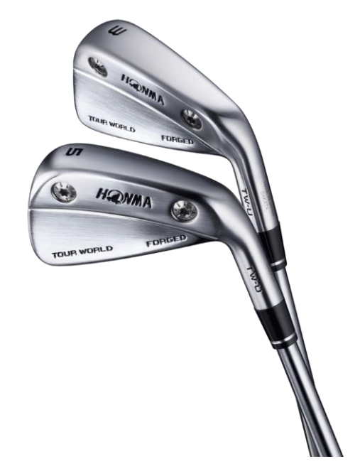
<TOUR WORLD TW-U FORGED>

Four lofts are available, to help satisfy the diverse needs of serious golfers.