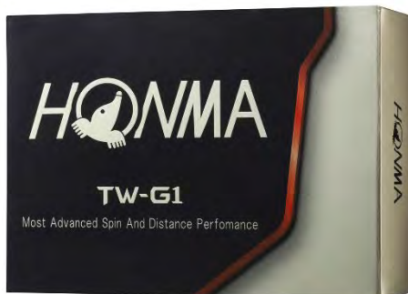
<TOUR WORLD TW-G1>

The TOUR WORLD TW-G1 series meets the high demand of competitive golfers, many of whom have preferred the original ball since its 2014 introduction. Now with improved carry distance, short-game spin and ball control, this model is being re-released as the new TOUR WORLD TW-G1 and TOUR WORLD TW-G1x.