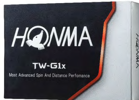
<TOUR WORLD TW-G1x>