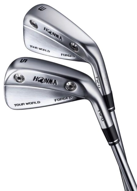
<TOUR WORLD TW-U FORGED>

For the outline of "TOUR WORLD TW-U FORGED", please refer the next page.